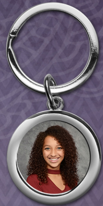
DELUXE KEY CHAIN