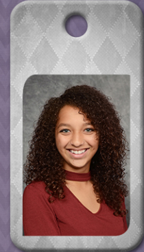
KEY FOBS (SET OF 3)