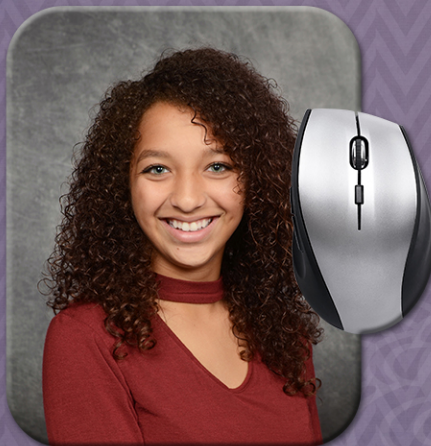
NEOPRENE MOUSE PAD