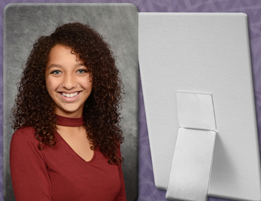
4X6 ALUMINUM DESK PRINT