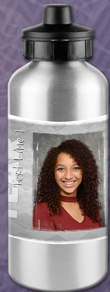
ALUMINUM WATER BOTTLE