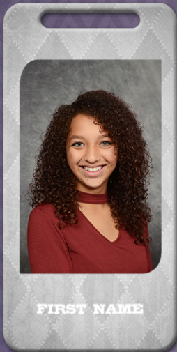
LUGGAGE TAG (SET OF 2)